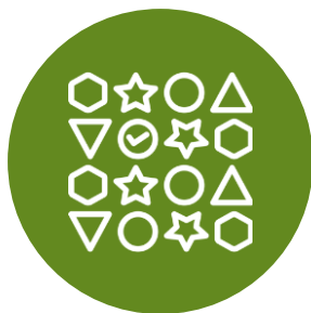
Diversity of data